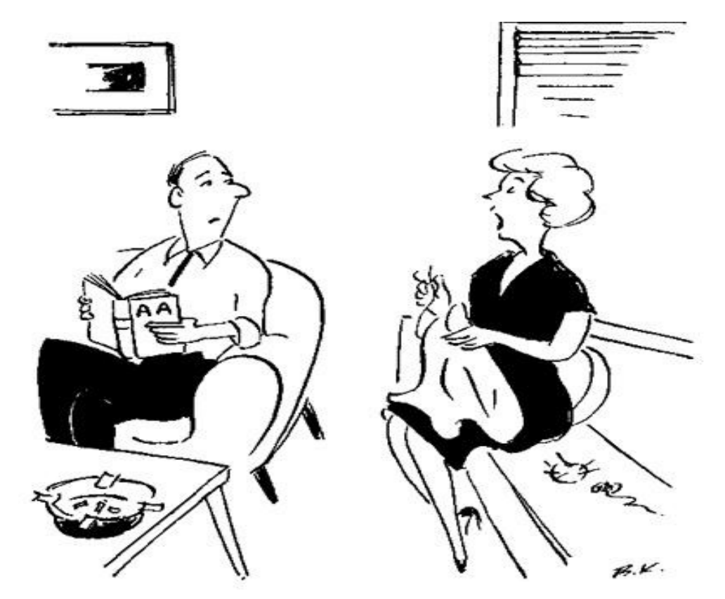
"Let me know when you take your inventory. You'll need my help!"

Every alcoholic is welcome at District 10 meetings, held on the fourth Sunday each month at St. Gilbert's Catholic Church, 301 E. Belvidere Rd in Grayslake—5:30 Tradition Meeting –6:00pm District meeting. http://www.district10nia.org