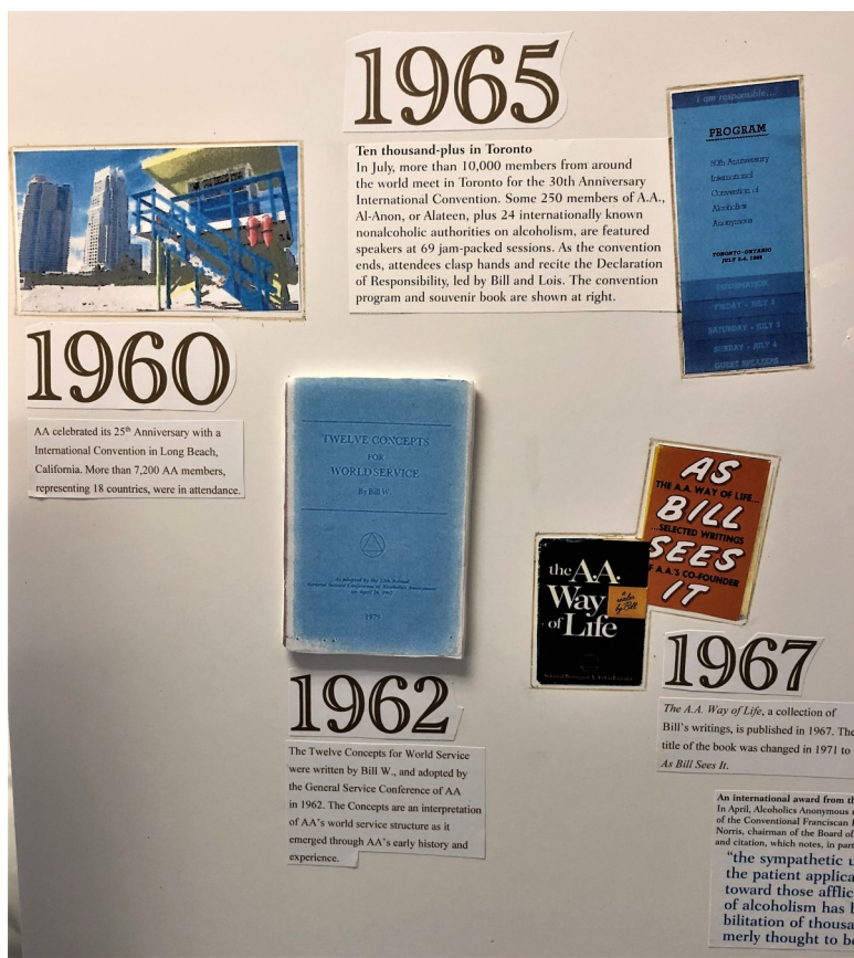
PHOTO ABOVE: Organizers displayed several examples of A.A. literature. The Bill W. bobblehead sits on the desk at the Serenity House meeting room where the “Anvils” event was held.